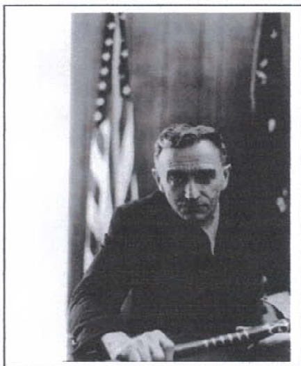
Mayor Wilbur Terynik—1970s